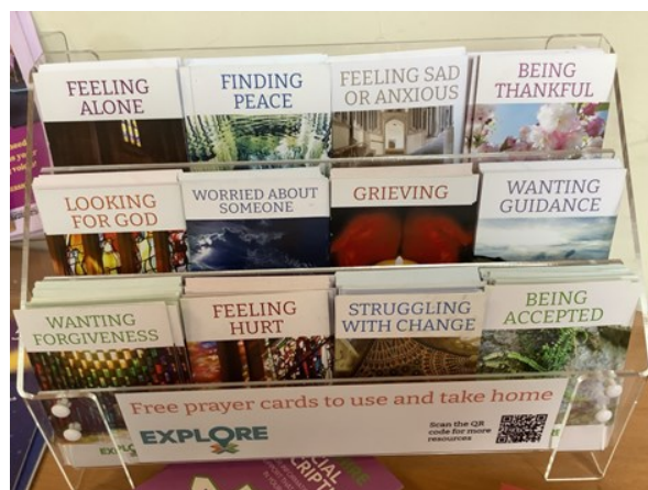
Front and back of a prayer card.

City Quiz 1.Which city supplied the steel to build the Brooklyn bridge in New York?